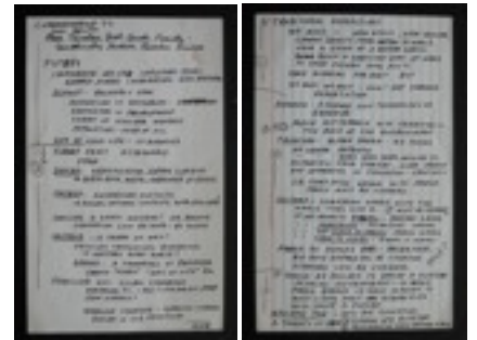
Above: Skinner's commencement notes