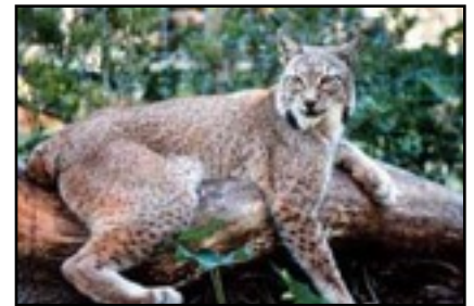
Kanawha the Siberian Lynx