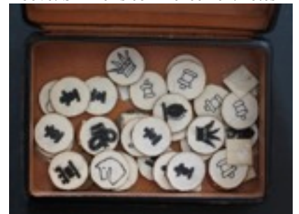
Above: Skinner's hand-made chess pieces