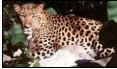
Simba the Leopard

Big Cat Rescue has a very strict program for training. There are four levels in which the animals and trainers are grouped: