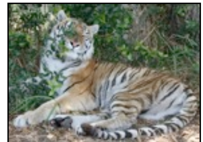
Bella the Tiger