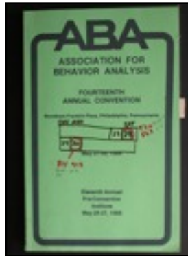
Skinner's program book